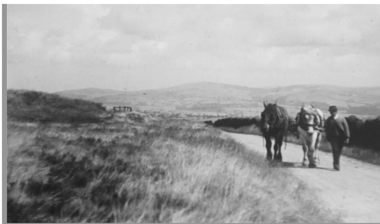
Above: Spotted recently on ebay. A 'lantern slide' c.1900 taken from Top Road, Biddulph Moor.